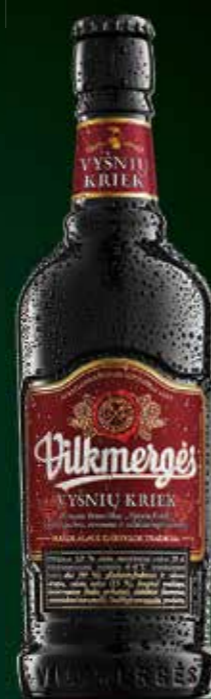
0.41 l glass