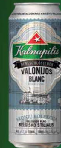
0.5 l can

Whitish gold colour and distinguished by a fruity flavour with notes of citrus.