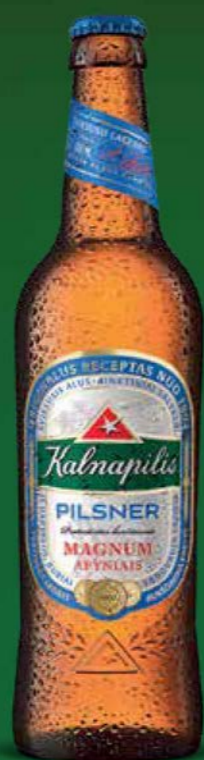
0.5 l glass

Kalnapilis Pilsner , created by relying on the old, traditional recipes of the Pilsner type, is gentle and of pleasant taste. A true classic – a glass of light Kalnapilis Pilsner . On any occasion.