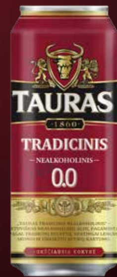
0.5 l can

Taurus "Traditional non-alcoholic" - Lithuanian non-alcoholic beer made according to traditional recipe. Beer which has light taste and bitter expression of hops.