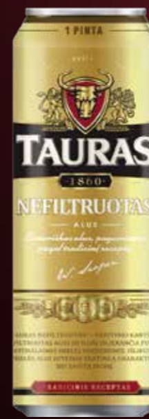
0.568 l can

Taurus "Unfiltered" - medium bitterness unfiltered beer with long-lasting foam and natural yeast sediment.