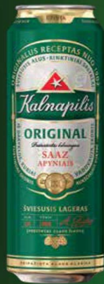
0.568 l can 0.5 l can 0.33 l can