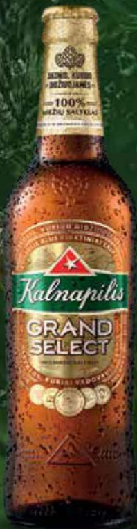
0.5 l glass

We produce Kalnapilis Grand Select step-by-step, patiently and carefully. From fresh water, exquisite hops, and top quality barley. We know how to wait. And so having brewed our beer without haste, we get a grand, mature taste. A taste we are proud of. That's why we call this beer Kalnapilis Grand Select .