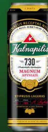
0.568 l can

This is the strongest and the most fragrant of our beers. Kalnapilis 730 is extremely savoury and its strong aroma goes perfectly well with its full-flavoured taste.