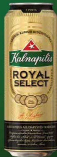
0.568 l can

Caramel malt "CaraAmber" awards Royal Select with dark gold color and notes of sweetish taste while the combination of aromatic hops "El Dorado" and "Select" grants this beer the distinguished aroma. Finally, Royal Select is matured twice longer than usual lager in such way beer becomes exceptionally smooth. Kalnapilis Royal Select - rich & smooth lager.