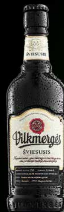
0.41 l glass

The beer has a slightly sweet aftertaste, unique fruit aroma and the bitterness of hops. We suggest pairing this ale with fried, smoked or stewed poultry meat. It also goes well with cold meat starters, mature Edam or Gouda cheese, meat salads or oily fish.