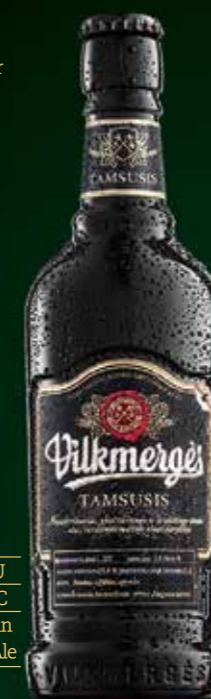
0.41 l glass

We use four types of malt to create our dark beer: Lithuanian light barley malt and three types of caramel barley malt. Caramel malt creates barely perceptible coffee aroma and flavouring. It also gives our beer light caramel aftertaste and a powerful flavour that characterizes dark beer. This beer pairs well with game meat and other dark meat dishes prepared on fire or grill. Vilkmergės dark ale also pairs well with aromatic rich-tasting mushroom and potato dishes, chocolate cakes and other sweet desserts.