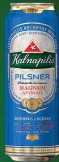
0.568 l can