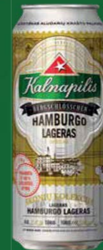
0.5 l can

Light amber color beer with easily expressed bitterness and distinguished by the refreshing aroma of organic hops.