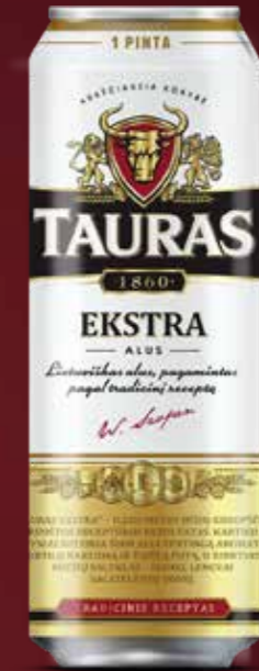
0.568 l can

Taurus "Ekstra" is a lager beer with bright golden color and strong texture. Classic "lager" beer has a clear hop bitterness and a strong residual taste.