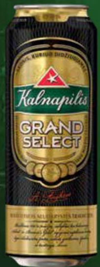
0.568 l can