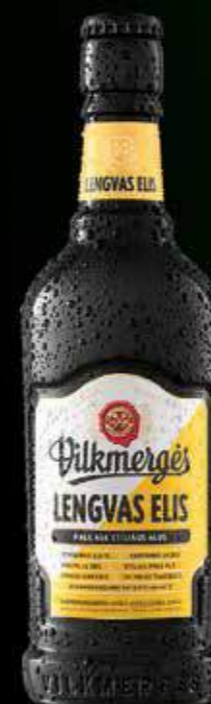
0.41 l glass

This beer pairs beautifully with light salads, various poultry dishes or snacks. Also, give it a try while enjoying exotic seafood or Oriental cuisine.