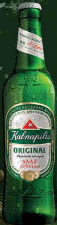
0.5 l glass

Creating Kalnapilis Original , our brewers chose "Saaz", the "noble" variety of hops. That is why this beer has an extremely rich and harmonious flavour with a strong, long-lasting head. Enjoy its unique flavour and aroma – as if it were freshly poured from the barrel.