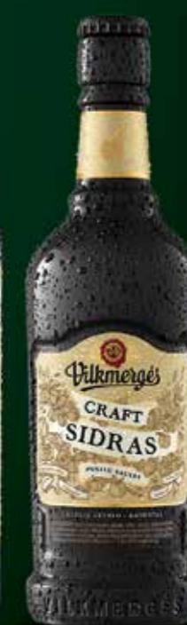
0.41 l glass