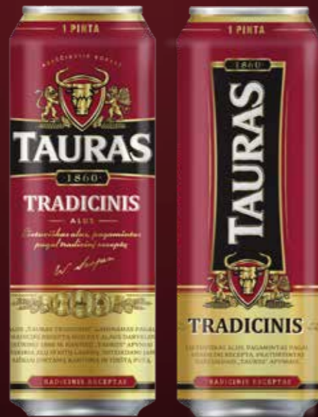
0.568 l can Double sided can design

Taurus "Tradicinis" - beer made from Taurus hops with a clear bitterness and a long lasting thick foam. "Taurus Tradicinis" beer best combines with cheese, smoked meat and steaks.