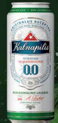
0.5 l can

Kalnapilis Non - Alcohol . The great taste and top-quality alcohol - free beer.