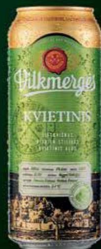
0.5 l can

Sweetish Vilkmergės wheat beer is great with both soft and hard cheeses. It also pairs well with grilled, steamed or raw seafood and various salads.