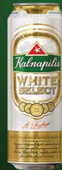
0.568 l can

Kalnapilis White Select is an especially light and fragrant Belgian style wheat beer. The CHATEAU WHEAT BLANC mild Belgian malt used for this beer reveals the best features of its taste and aroma. Its natural carbon dioxide does not bite the palate and you can therefore experience every subtle note of its taste. Its exclusive features and unique ingredients are the pride of our brewers.