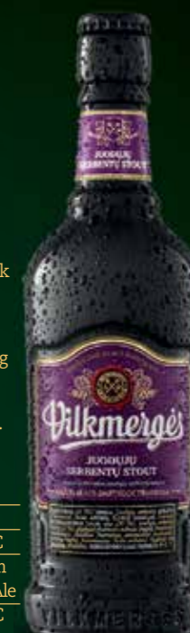
0.41 l glass

Vilkmergės Blackcurrant Stout – a sweetish, intensive, black-coloured beer with fresh blackcurrant aroma, burnt malt and berry aftertaste. This is the first Lithuanian blackcurrant stout. Vilkmergės Blackcurrant Stout goes well with brie or goat cheese, Mascarpone canapés and cheesecakes. Vilkmergės Blackcurrant Stout is also a great addition to fresh blackberry or strawberry cakes.