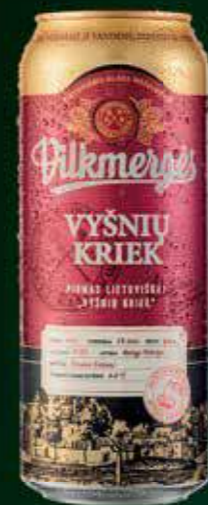
0.5 l can