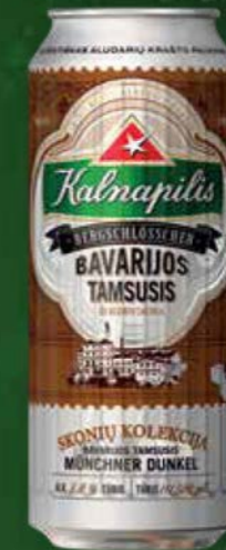
0.5 l can

The rich flavour of roasted malt balanced with the soft sweetness of a caramel aroma and the light bitterness of the hop plant