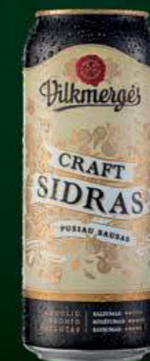
0.5 l can

Subtle tannin aftertaste and expressive apple aroma makes it even more distinctive. Brewed from ripe and carefully selected apples, Vilkmergės Craft Sidras is a semi-dry cider matured here in Lithuania. This cider pairs well with meat dishes, especially with sweet and sour or fried pork, or crispy chicken. It is also a great addition to Cheddar and blue cheeses, and apple pie.